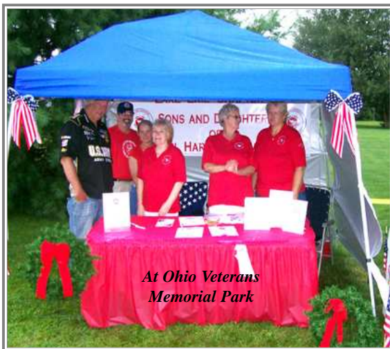
At Ohio Veterans Memorial Park